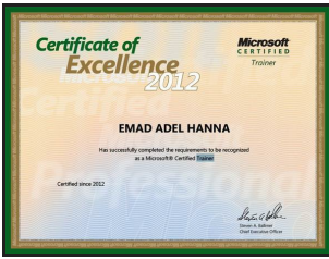
Certified Trainer (MCT)